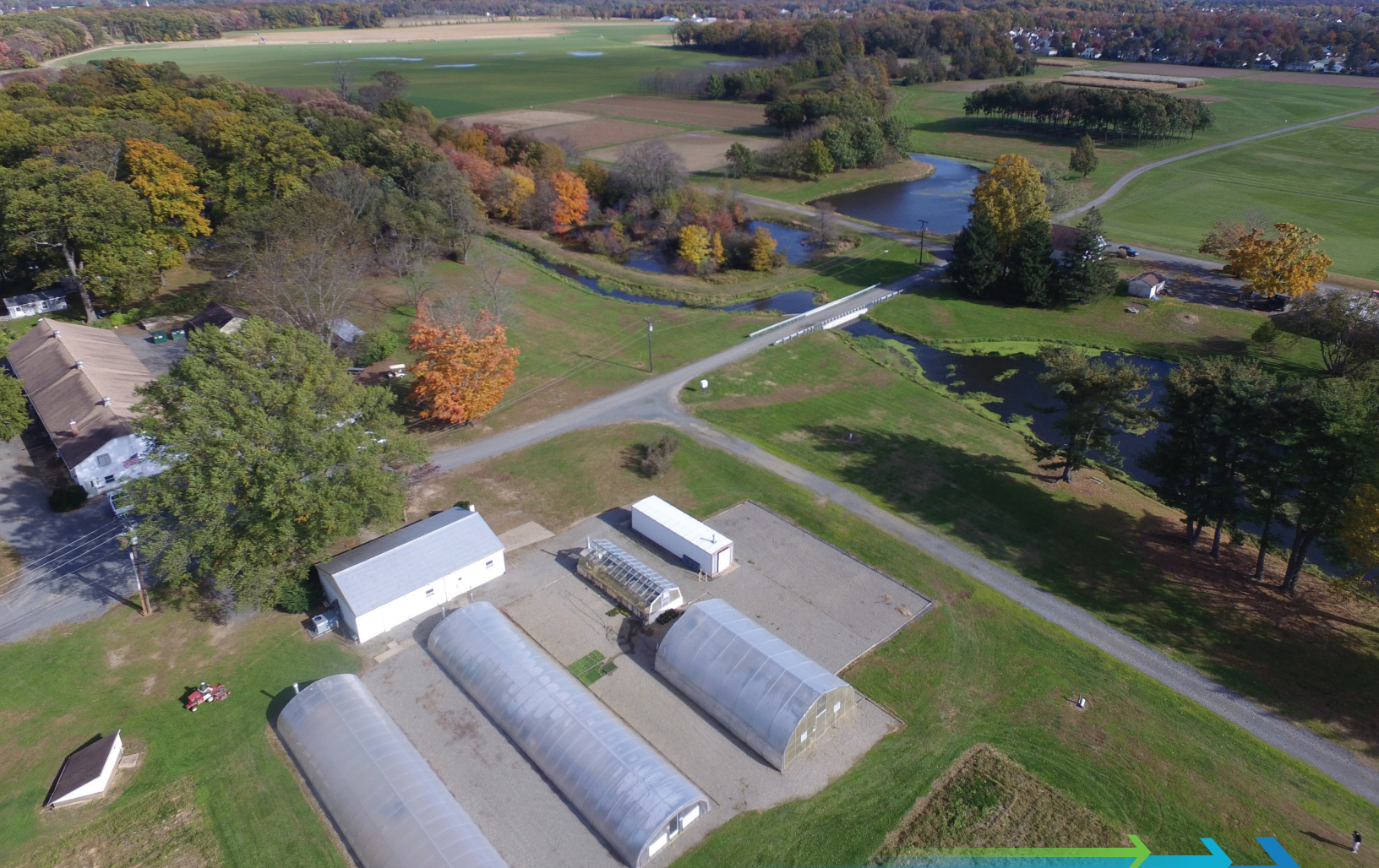
Aerial photo of the Plant Science Research and Extension Station in Adelphia, New Jersey, where Monmouth County is undertaking a major project to realign Halls Mill Road and reconstruct a dam that is owned by Rutgers and is a critical irrigation source for the farm.