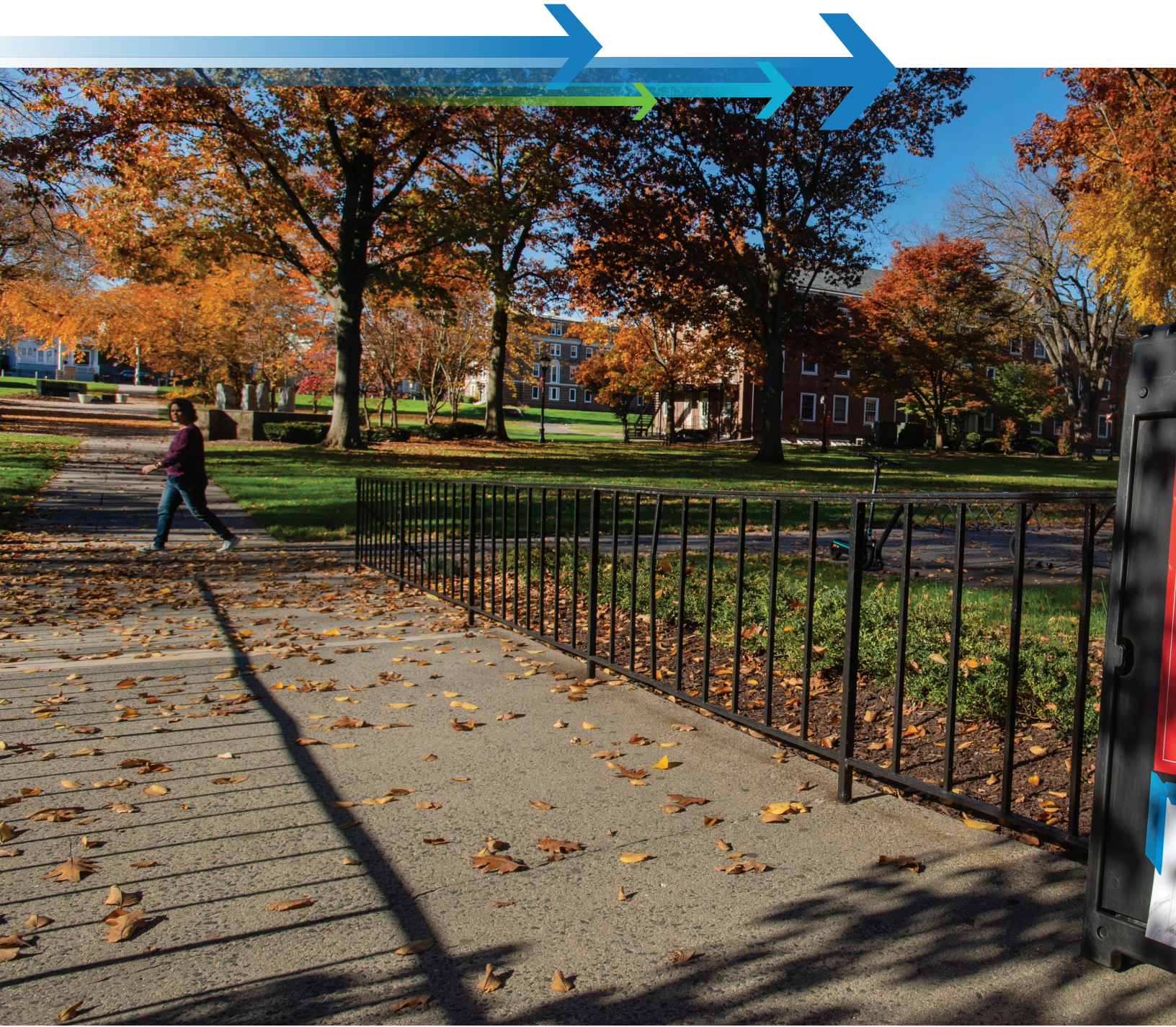
Entrance to Old Queens with posted regulations pertaining to COVID-19 pandemic.