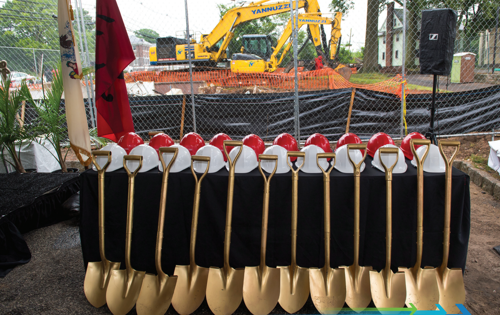
Groundbreaking ceremony for the Rutgers Center for Adult Autism Services.