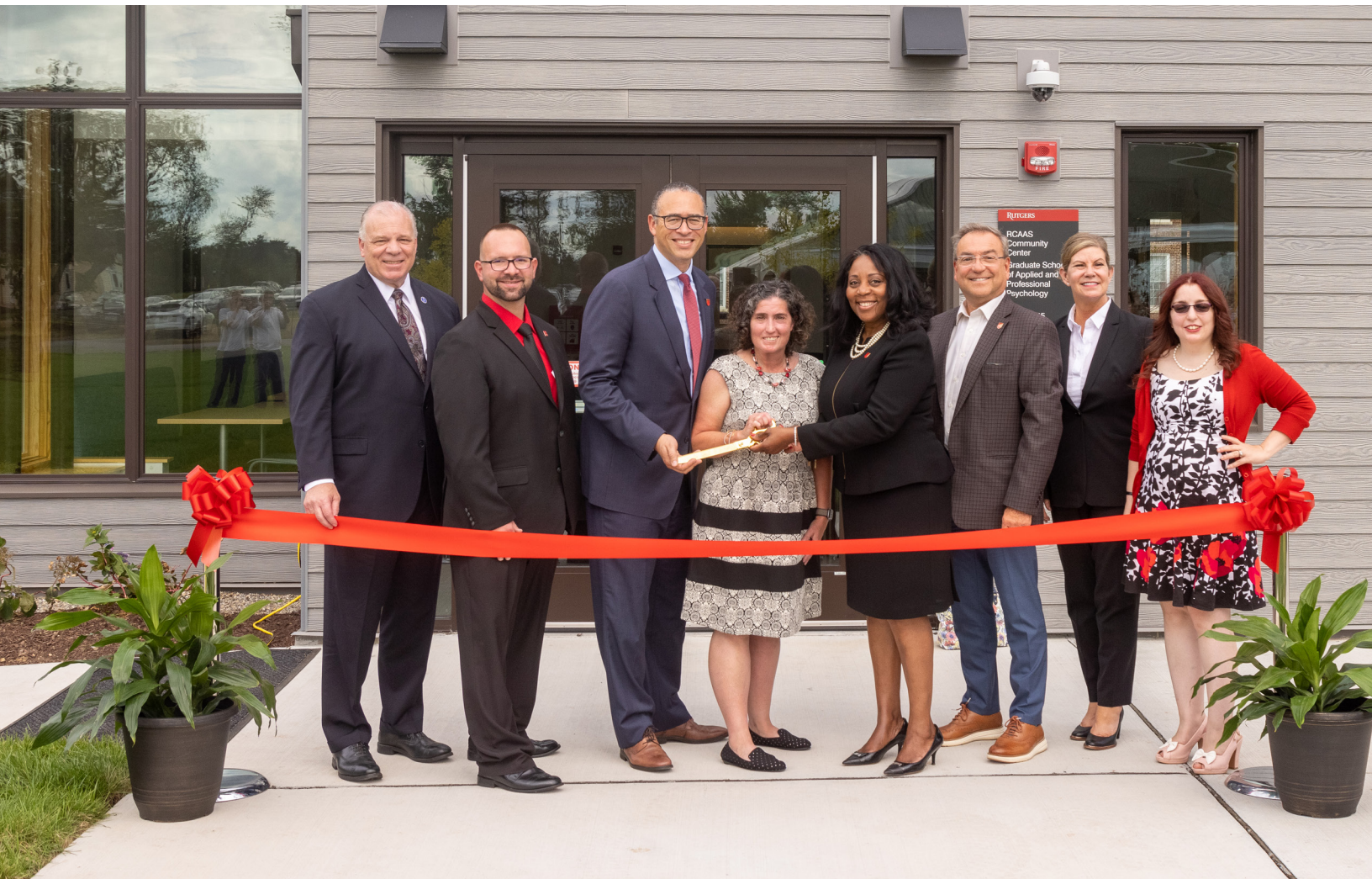
The official RCAAS Community Center ribbon cutting ceremony, September 2021.

Rutgers University is on a mission to be known as a place where students who think and learn differently are welcomed and included. To accomplish this, we brought together two centers from the Graduate School of Applied and Professional Psychology (GSAPP), the Rutgers Center for Adult Autism Services (RCAAS) and the Center for Youth Social Emotional Wellness (CYSEW), to develop a holistic model that promotes student wellness and well-being. The Rutgers CSP seeks to enrich the college experience and promote the overall success of university students with ASD and/or ADHD at all stages of their educational journey, from admission to graduation.